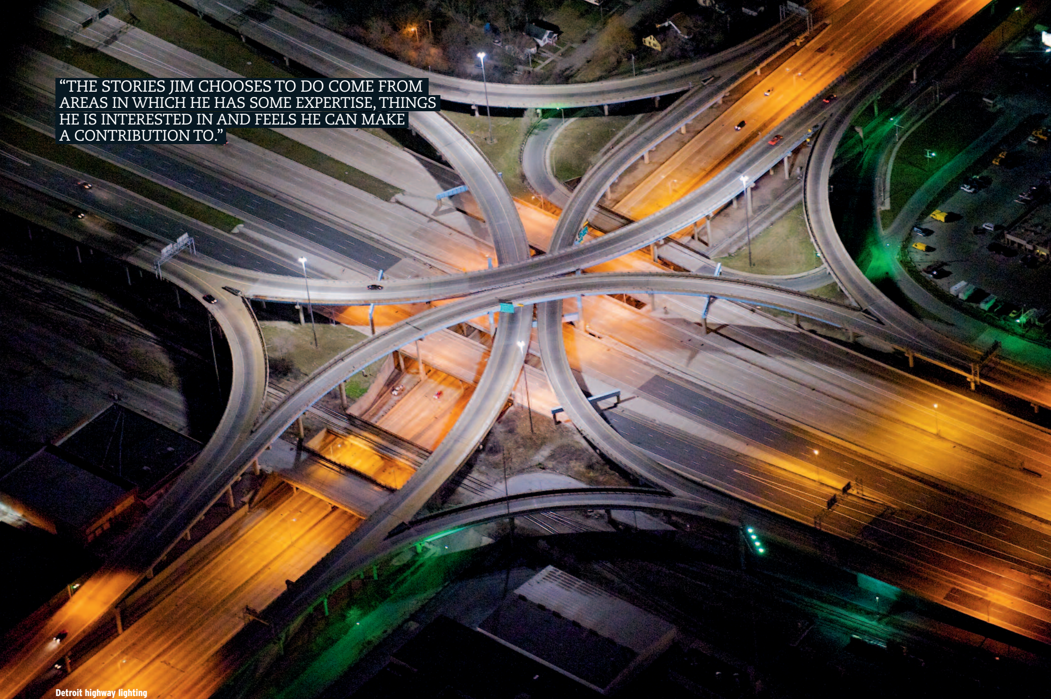
Detroit highway lighting